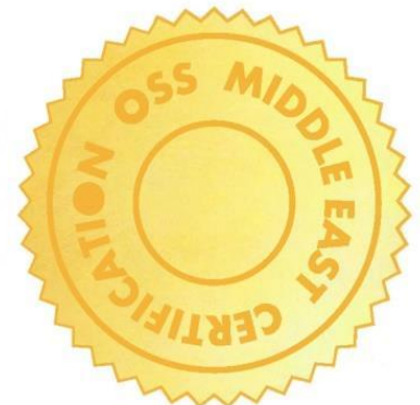
Oss Middle East General Manager

Certificate is valid for 3 years (11/01/2025 to 10/01/2028) from the date of Initial registration. Upon successful completion of surveillance audit a new certificate with an extended validity will be issued. Rev.00, dt. 11.01.2025